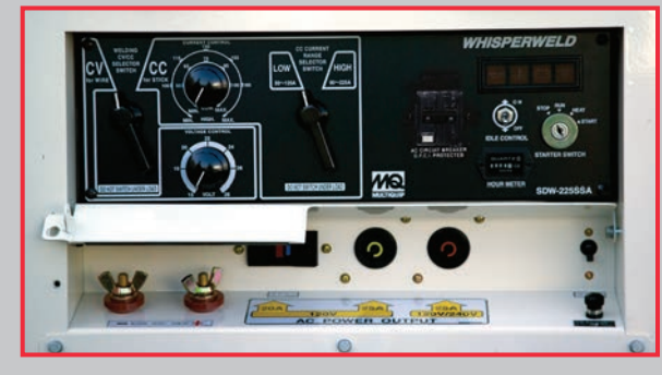
Full instrumentation is protected by a lockable cover panel. Controls for both CC and CV welding, along with engine condition indicators, are included.