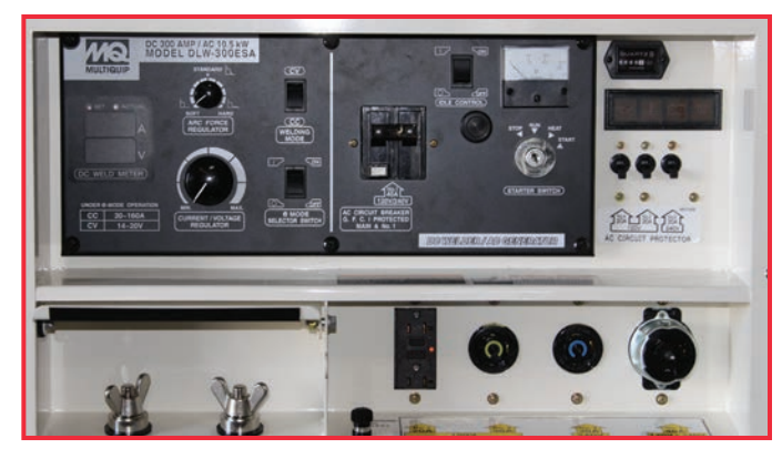
Full instrumentation is protected by a lockable cover panel. LED display provides clear readouts for both CC and CV selections.