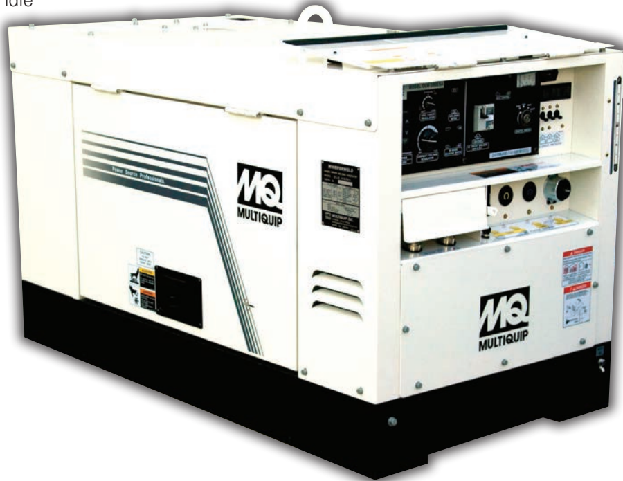
DLW300ESA1 300 amp welder 10.5kW AC output Kubota diesel engine