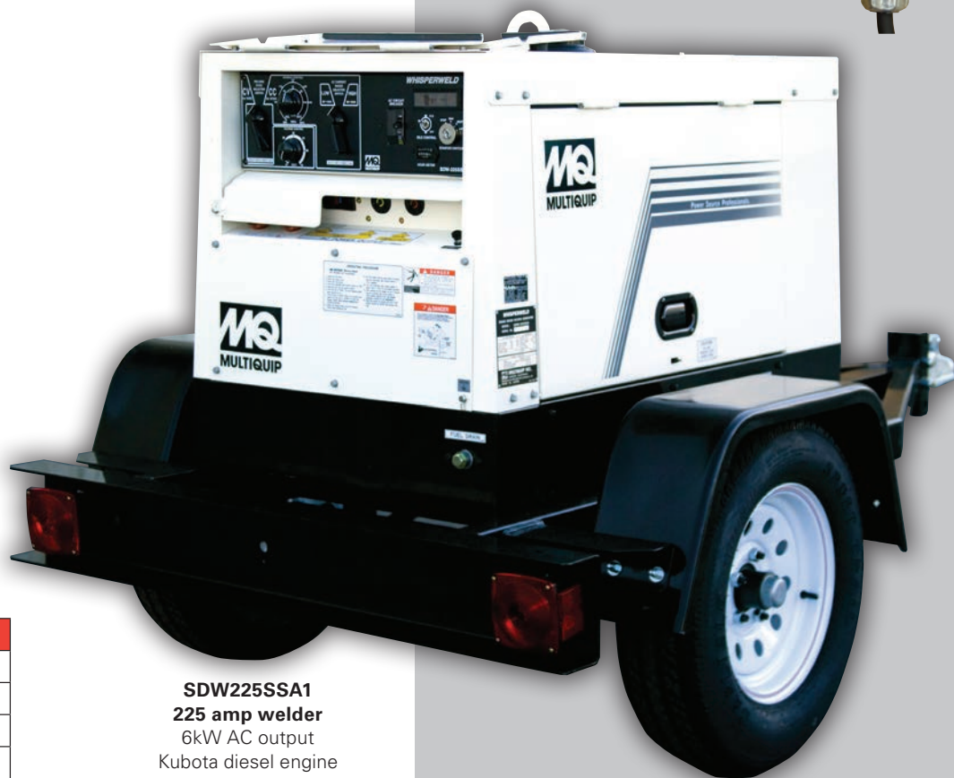
SDW225SSA1 225 amp welder 6kW AC output Kubota diesel engine Shown with optional trailer

Also available in light tower configuration as model MLT-SDW7